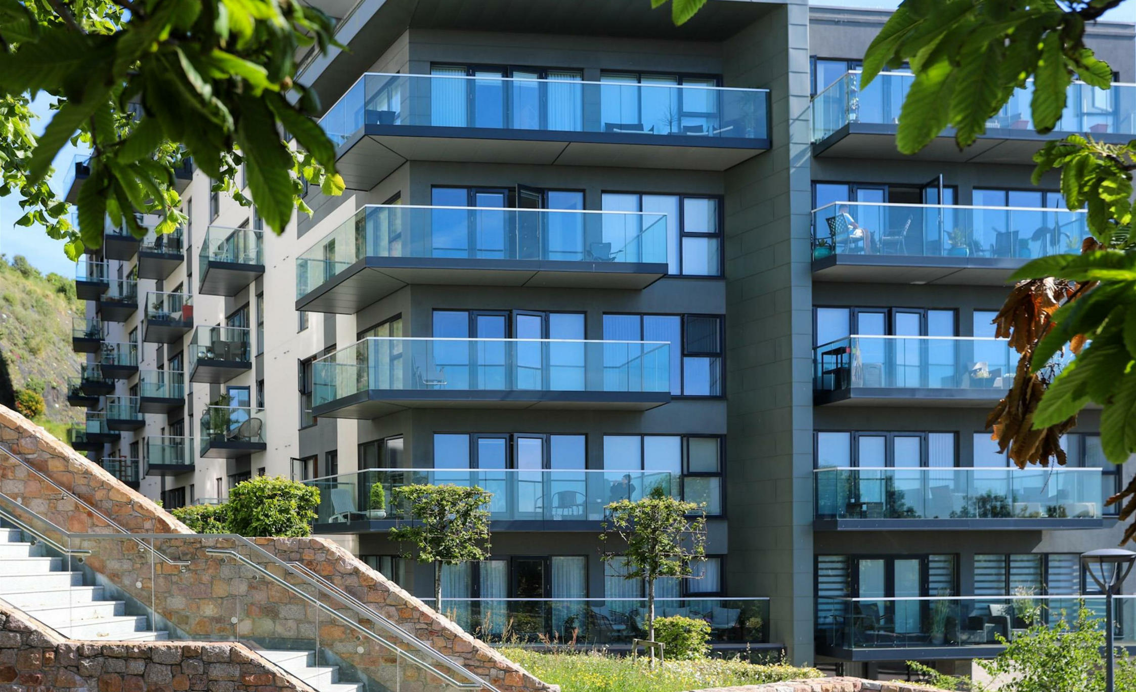
B109 Westmount Apartments, St Helier, Jersey, JE2 3LP £1,450